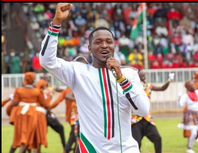
Mashujaa Day performance