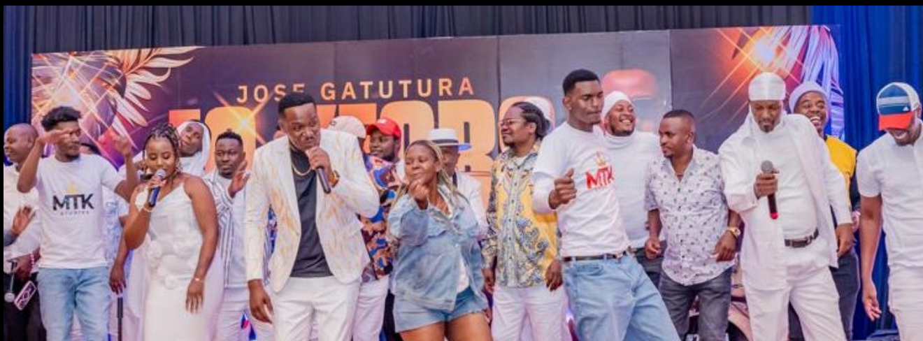
High level executives performance at Safari park hotel

Fans go into a frenzy Fans just cant get enough of his electrifying music.