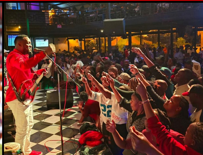
Acknowledging greetings from fans